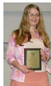
Ms. Dorina Sava Alexiou Award in Environmental Chemistry