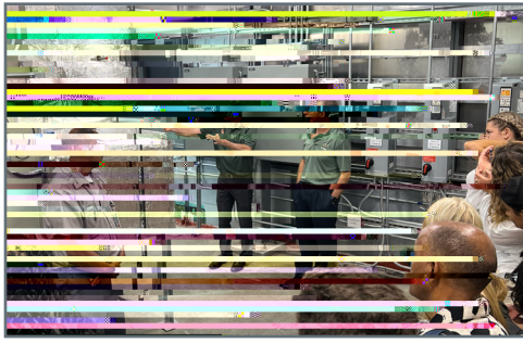
Don Crosby showcasing the Honors College DOAS-1 (Dedicated Outdoor Air System), which is used to reduce the building's energy consumption.